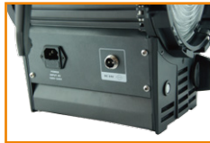
D-LFS series DC 24V Input Connector