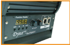
D-LFS series Control Board