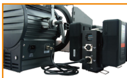
Dynacore D-4BS/A extender supply power to D-LFS series LED Fresnel Spot Light through 24V output